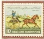
Thurn & Taxis postal service 1852 - 1867.