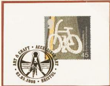
Above: The sign painted on roads in G.B. for a Cycle Lane.