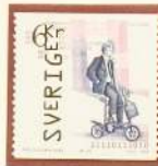
Bicycle for the man about town, in future?

CH - 1524 Mr Sole Brian 3, Stockfield Road GB - Claygate Esh, KT1000G