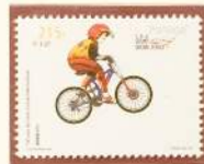
Above right: Cross frame mountain bike and (right) smaller frames with dropped top tube are popular with children.