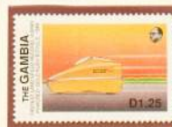
Below: The Easy Racer Gold Rush reached 105.37 km/hour.