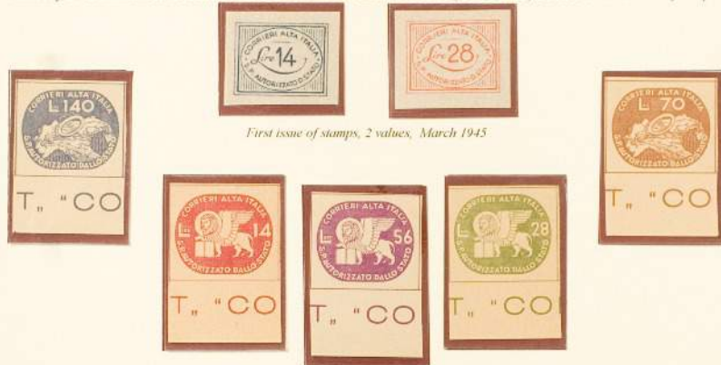
First issue of stamps, 2 values, March 1945

Second issue of 5 values issued mid March 1945. Values L.70 & L.140 show route Turin, Milan, Venice, Trieste. Designer: F. Grassi.