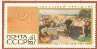
Above 'Farmer's Holiday' Painting Gerasimov 1937.

The bicycle as a subject extends into design, including Road architecture, in addition to appearing in Art Galleries.