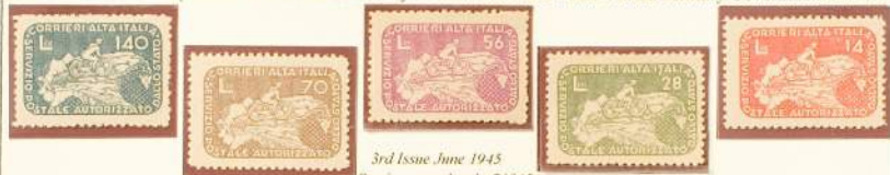
3rd Issue June 1945 Service ceased end of 1945

CORALIT service suspended 28.4.45. re-licensed by Administration of Posts/ Allied Military Government 21.5.45.