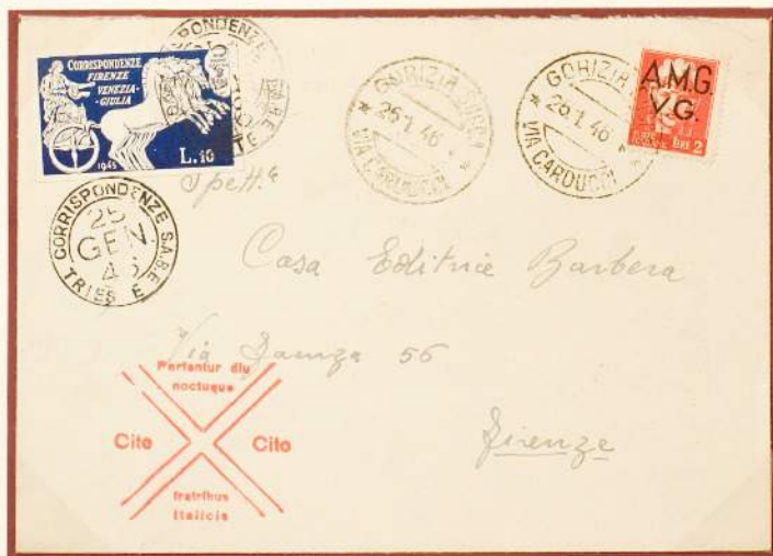
Service ceased early 1946.