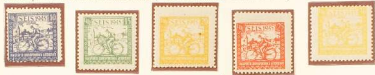
5 stamps prepared June 1945, not used, service ceased.

Società Espressi Italia Settentrionale (S.E.I.S.) delivered mail in Veneto, Lombardy & Emilia until June 1945.