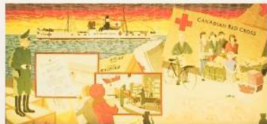
ONE PANEL OF THE JERSEY OCCUPATION TAPESTRY

It was also the temporary home of the Occupation Tapestry, a spectacular set of twelve tapestry panels (one of each parish) depicting scenes of the occupied years in Jersey. The tapestry is now permanently housed on the New North Quay.