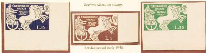
Regions shown on stamps.

Società Anonima Barbera Editore (S.A.B.E.) authorised 7 August 1945 for cycle postal service in Northern Italy