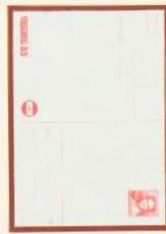
Below: Front of the postal stationery card, on the left, reduced in size.