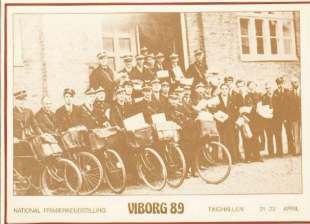
Left Postmen ready to go on their rounds.