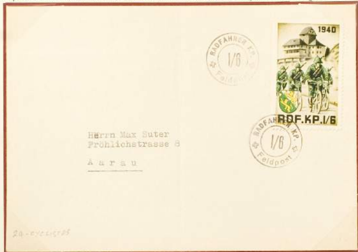
Above soldier stamp used by First Bicycle Company Sixth Battalion.

Despite the mountainous terrain, Switzerland maintained several Bicycle Units throughout the War.