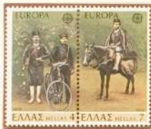
Postmen in Cretan uniform.

Potential for mail delivery soon realised see Bochum stamps.