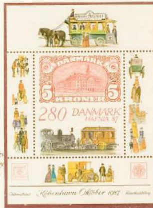
Miniature sheet issued for Exhibition "Hafnia 87"