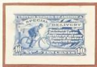
Proof of stamp in use 1902-17.

The bicycle has continued to be used for delivery of urgent mail both in cities and in rural areas.