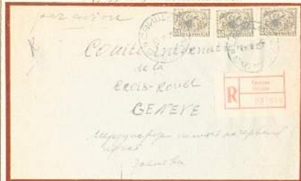
Copy of front of cover, reduced in size.