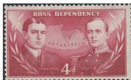
Scott and Shackleton